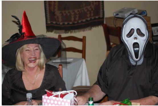
Dressing up for dinner.