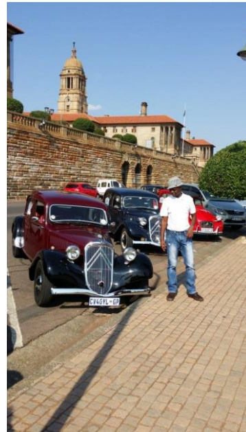
An interested observer