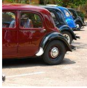
Rear view at Blue Crane Restaurant