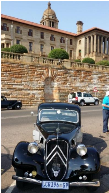
1937 Traction Avant Coupe

Finishing a leisurely lunch, final directions were handed out and we set off to next cultural site on our journey. Directions were tossed out the window, once we realised Loftus was a no go area with the World Super Cross circus in town. So a few quick diversion brought us to the front of the Union Buildings. This beautiful Herbert Baker designed building was the perfect back drop for the Traction.